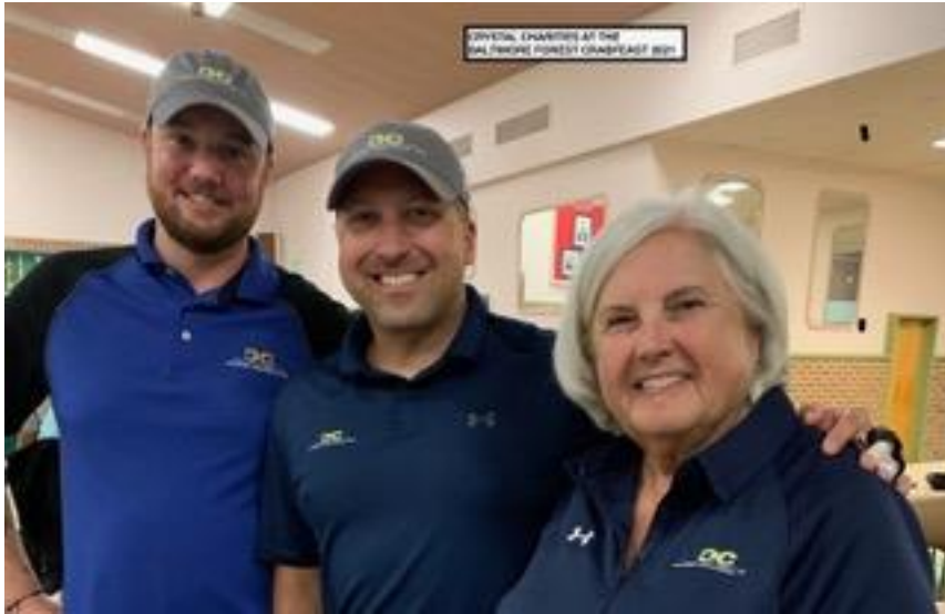
Crystal Charities, Inc. at the summer crab feast.