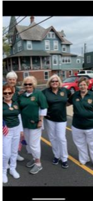
2019 Cedarettes Walking Group