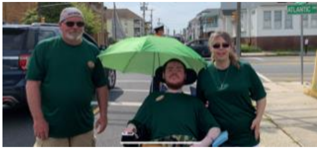
2019 Convention The Colgin Family