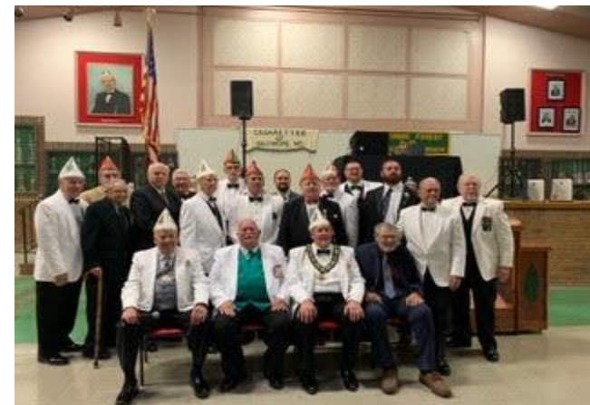
100 th Anniversary Tall Cedar Attendees