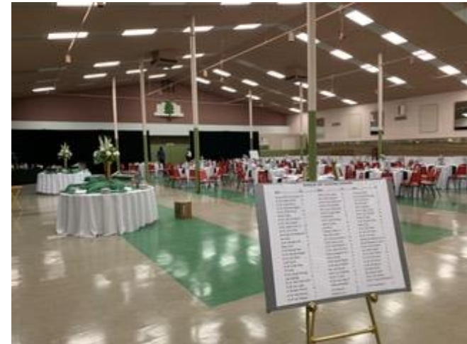
TCL Balto. Forest