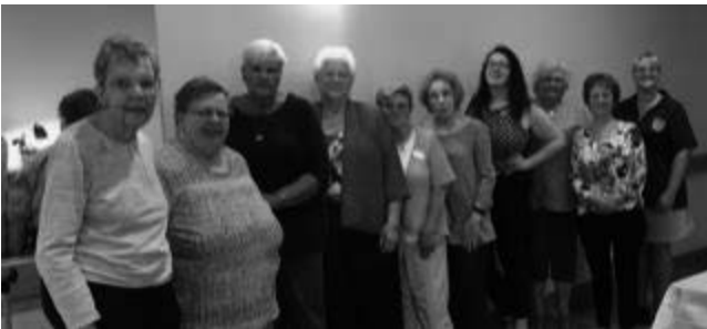
CEDARETTES PAST PRESIDENT'S NIGHT SEPTEMBER 2019