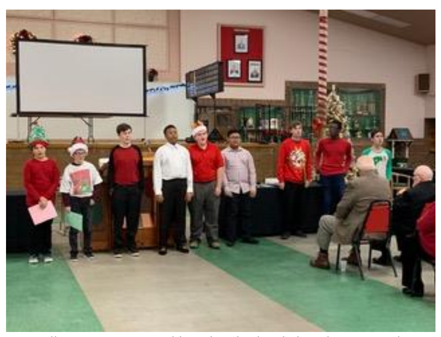
All were entertained by a local school choral group and they were great.